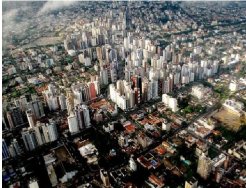
Curitiba, capital of Paraná.

The subtropical climate, with the lowest temperatures in the country, predominates in the region. In addition to remnants of Araucaria Forest, the South is covered by vegetation favorable to cattle raising, one of its main economic activities.