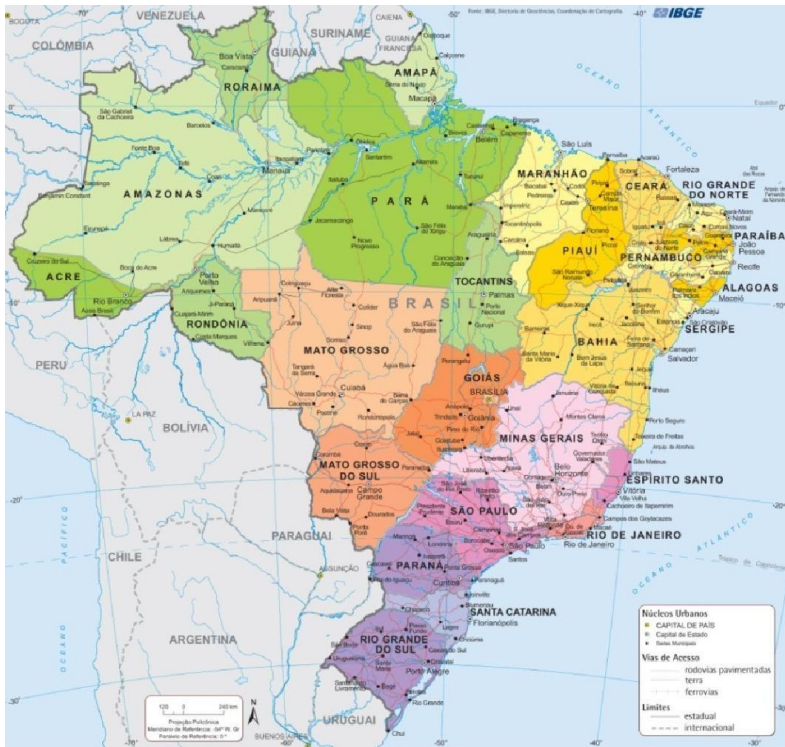
Political map of Brazil.

Official name: Federative Republic of Brazil