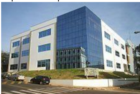
State University of Campinas - Unicamp.

Within the scope of the graduation, the Bachelor's Degree is the designated title to the professional from different areas of knowledge that will work in different fields of work and activities, as a professional practice