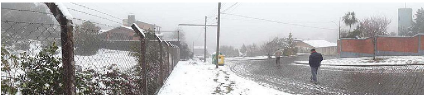
Winter of 2013 in Caxias do Sul, Rio Grande do Sul - RS.

➤ Check the season of the year in which you will arrive and the climate of the region of the country you are intended for, to bring appropriate clothing.