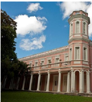
Federal University of Ceará - UFC.

HEIs can be public or private. Public institutions are created and maintained by the government in the three spheres – federal, state and municipal. Private institutions are created and maintained by private legal entities, with or without profit.