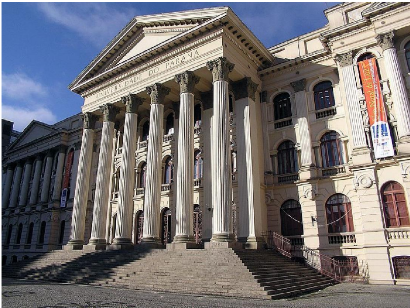
Federal University of Paraná - UFPR, one of the oldest in Brazil.

Brazilian Higher Education is basically governed by Laws 9.394/96, 9.131/95, 9.192/95, by the Opinions and Resolutions