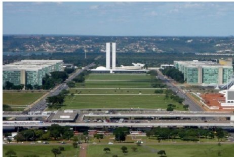
Brasilia, capital of Brazil.

In the 60s, the settlement of the Midwest was accelerated by the transfer of the federal capital to Brasília. The population was formed with migrants coming from all other regions of the country. The urban population is relatively large.