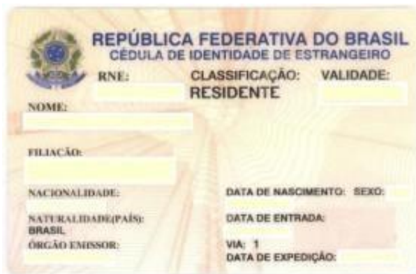
Foreigner's Identity Card - CIE.

After the delivery of the documentation, the Federal Police will provide the student with a protocol until the issuance of the Foreigner's Identity Card (CIE), which may take some time.