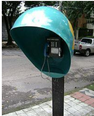
Public telephone, or payphone.

Nowadays, with the expansion of the use of mobile phones, public telephones are used less and less.