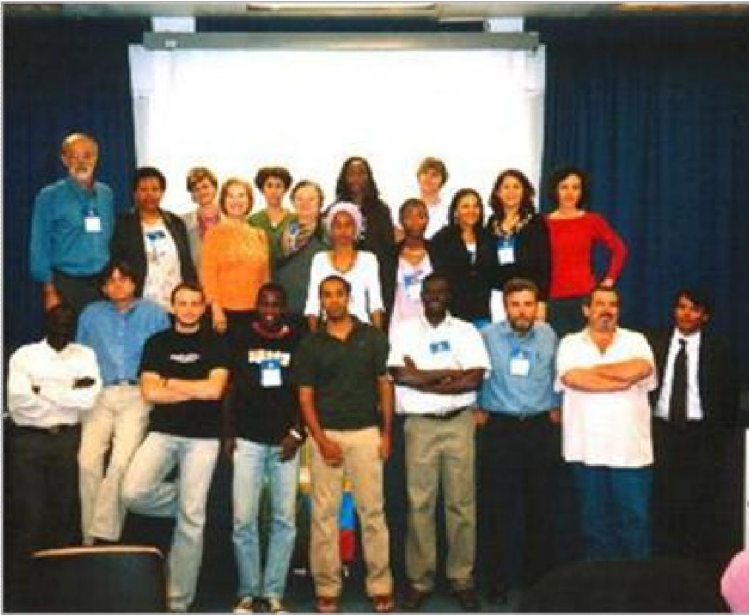
Students-agreement and managers of the PEC-G at a regional meeting to evaluate the Program, in Florianópolis-SC, 2005.

Created in 1964, the Undergraduate Student Agreement Program (PEC-G) offers undergraduate vacancies in Brazilian Higher Education Institutions (HEIs) to students from developing countries with which Brazil has an educational, cultural or scientific-technological cooperation agreement.