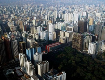
São Paulo, capital of São Paulo.

It comprises the states of Espírito Santo (ES), Rio de Janeiro (RJ), Minas Gerais (MG) and São Paulo (SP).